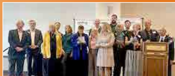
Past and current Dixon Award recipients gathered at the 2023 luncheon.

Because no one knows what goes on behind closed doors.