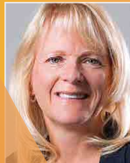
MEDIA D'VAL WESTPHAL